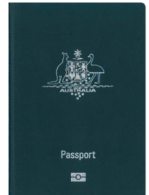
Australian or foreign passport