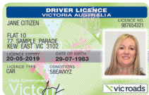
Australian driver licence