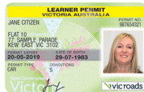
Victorian learner permit